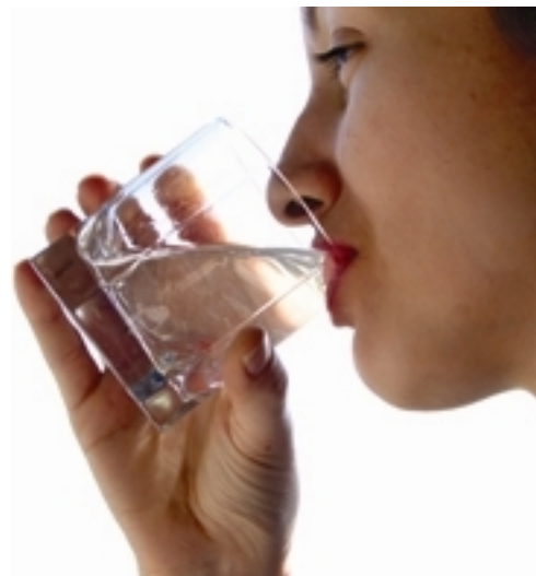
Water helps keep the body at optimum health.

Not only is water important for skin health, it can also play a key role in the prevention of disease. Drinking eight glasses of water a day can decrease the risk of colon cancer, bladder cancer, and potentially even breast cancer.